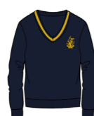
V-neck wool jumper